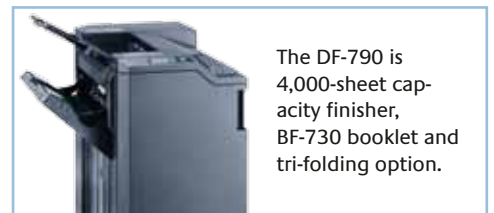
The DF-790 is 4,000-sheet capacity finisher, BF-730 booklet and tri-folding option.