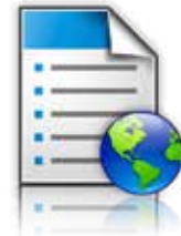
Forms and Favorites

Display Customization: Display a customized, scrolling slideshow on the color touch screen to communicate important messages to users while the printer is in sleep mode.