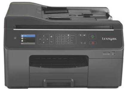
Lexmark OfficeEdge Pro4000 Color MFP