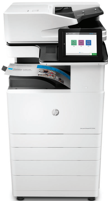
HP Color LaserJet Managed MFP E77825dn

Businesses that stay ahead don't slow down. It's why HP built the next generation of HP Color LaserJet MFPs—to power productivity with a streamlined design that delivers premium color value, maximum uptime, and the strongest security. 1