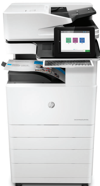
HP Color LaserJet Managed Flow MFP E77825z