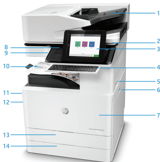
HP Color LaserJet Managed Flow MFP E77825z