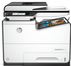
HP PageWide Pro 577dw Multifunction Printer