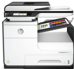
HP PageWide Pro 477dw Multifunction Printer