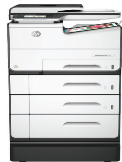
HP PageWide Pro 577z Multifunction Printer