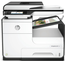
HP PageWide Pro 477dn Multifunction Printer

Ultimate value and speed—HP PageWide Pro is faster 1 and more affordable 2 than any other color MFP in its class. Get professional-quality color documents, fast two-sided scanning, plus best-in-class security features 3 and energy efficiency. 4