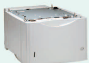
Q2440A (500-sheet) Q2444A (1,500-sheet)

500 and 1,500-sheet paper trays for up to 2,600-sheet input capacity