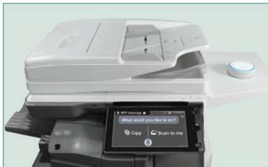
MX-M4051 shown with available Sharp MFP Voice feature with Alexa.