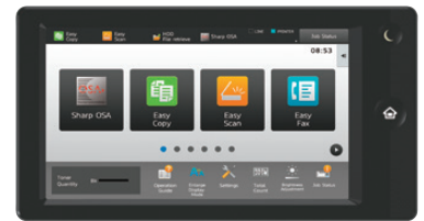
Award-winning 10.1" (diagonal) customizable touchscreen display.