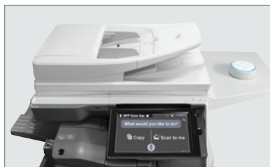
MX-6051 shown with available Sharp MFP Voice feature with Alexa.