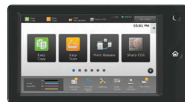
Award-winning 10.1" (diagonally measured) customizable touchscreen display.