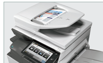
Sharp's ImageSEND™ feature provides one-touch distribution to email, cloud applications and more.