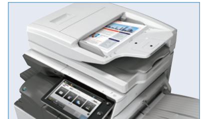
Sharp's ImagesSEND™ feature provides one-touch distribution to email, cloud applications and more.