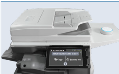
MX-6071 shown with available Sharp MFP Voice feature with Alexa.