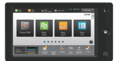
Award-winning 10.1" (diagonally measured) customizable touchscreen display.