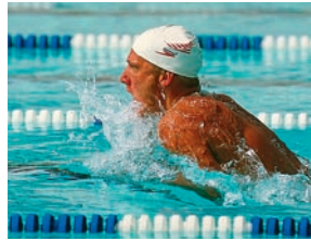
With HD Color technology

Along with 1200 x 600 dpi resolution, the HD Color printing technology of the C5650 Series Digital Color printers provides greater depth of detail and color, and a high gloss finish, even on ordinary office paper.