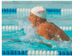
Without HD Color technology

Digital Color printers from OKI Printing Solutions deliver more than brilliant output at productivity-enhancing speeds. The C5650 Series also gives you control over the quality of your output and improves your image: