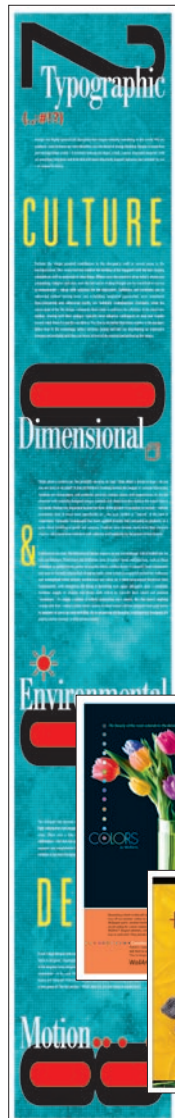
8.5" x 48" Banner